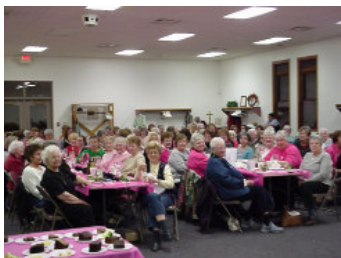
Attendees enjoying the food, fellowship & speaker